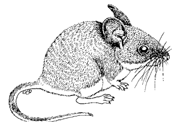
Figure 2. Deer mouse.

A key to successful long-term mouse control is the limitation of shelter and of food sources wherever possible. Trapping works well when mice are not numerous, or it can be used as a follow-up measure after a baiting program. When considering a baiting program, decide if the presence of dead mice will cause an odor or sanitation problem. If so, trapping may be the best approach. Removal of mice should be followed by taking steps to exclude them so